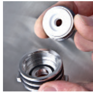
Revolutionary sealing system in cartridge construction allows quick and easy replacement of the sealing lips