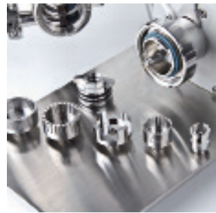
Flexible use of different rotor / stator configurations and sizes