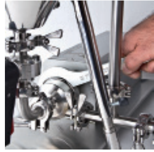
Easy cleaning and maintenance

LED status indicator: Ready, active load detector, keypad for operation, drive selection and parameterization