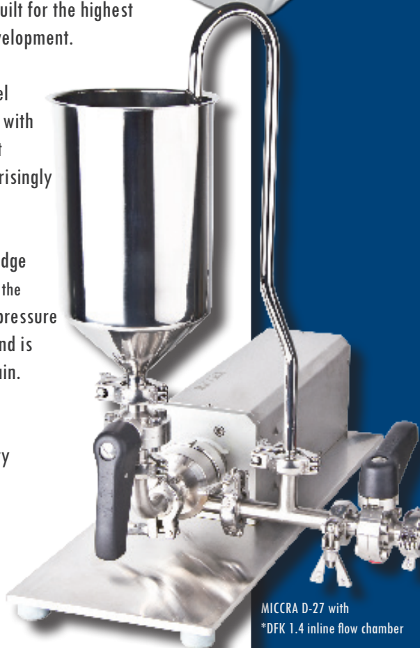
MICCRA D-27 with *DFK 1.4 inline flow chamber

The perfect solution for the continuous operation in laboratory and pilot plant, hands down.