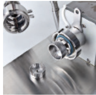
Quick tool change